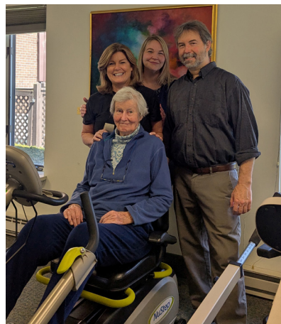
Physical Therapy and Rehabilitation