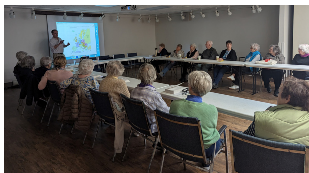
Book Studies, Classes and Lectures