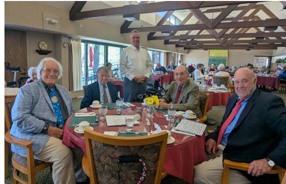
Exceptional Dining Every Day