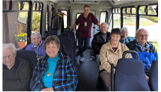
Outings and Excursions