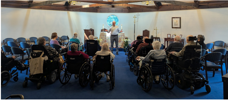
Weekly Chapel Services