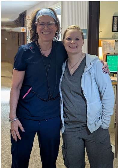
Devoted Nursing Staff