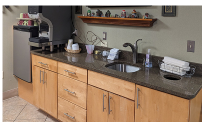
(Left) The Noble Café is a hub for many residents to enjoy a cup of coffee, read the local news and socialize!