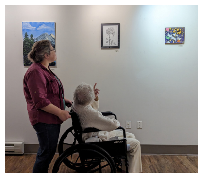
(Below) Noble hosts various art shows each year, all are open to the community.