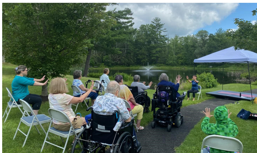
Chair Yoga and Meditation Hour enjoyed by Residents and Community Members

We LOVE visitors at Noble Horizons! Many people don't realize that Noble's beautiful campus is open to the public – including our art exhibits, walking and biking paths, and even exercise classes (at no cost to visitors). The connection between our residents, staff and community is at the heart of Noble Living.