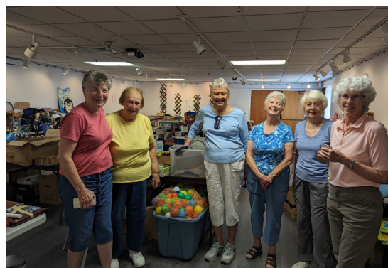
(Above) The annual Auxiliary Tag Sale Team was in full swing!