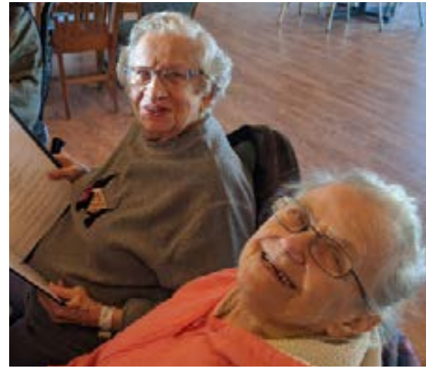
Above: Ordering a winter luncheon at the Canaan Country Club.