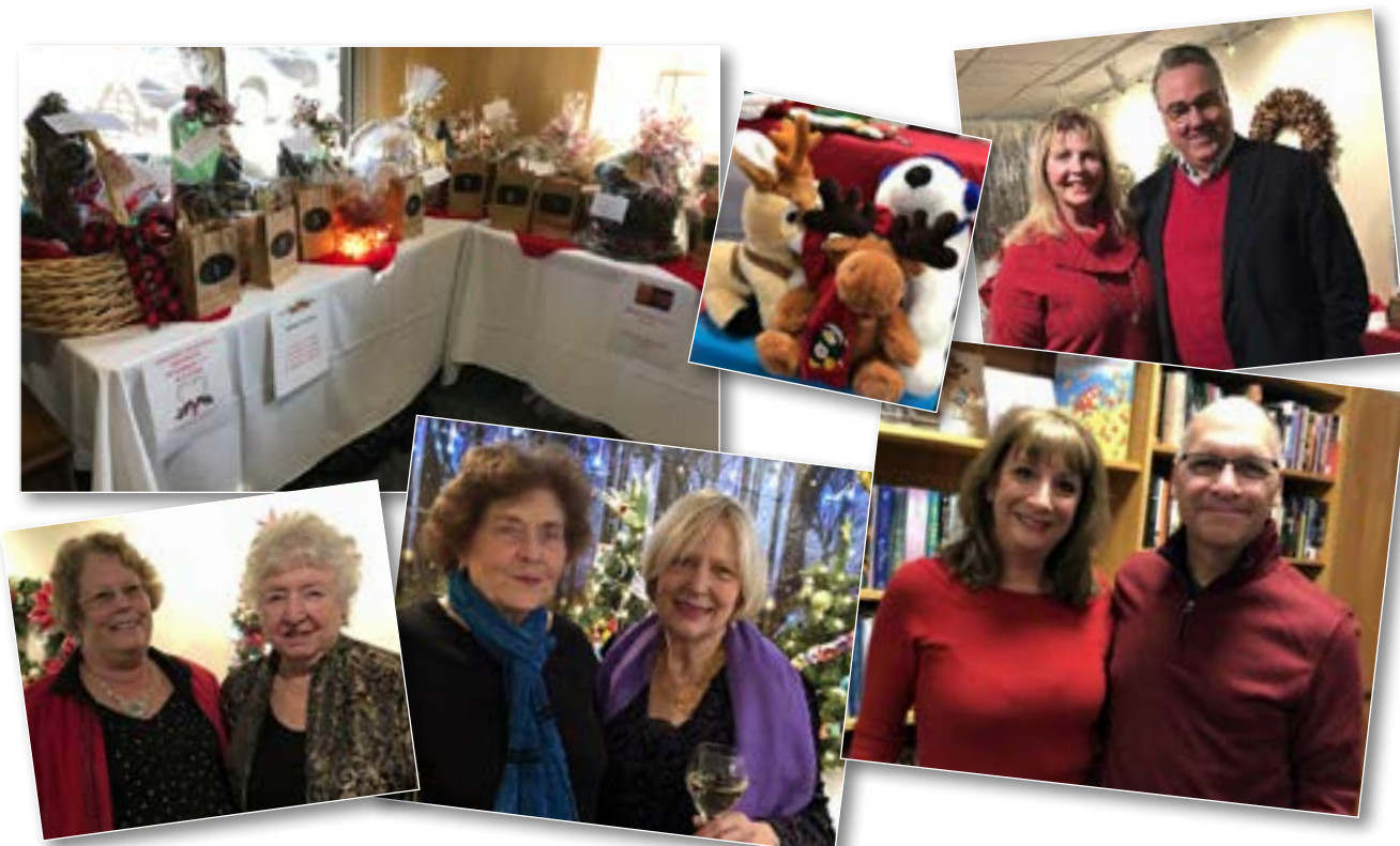
All photos from the Gala courtesy of Rural Intelligence