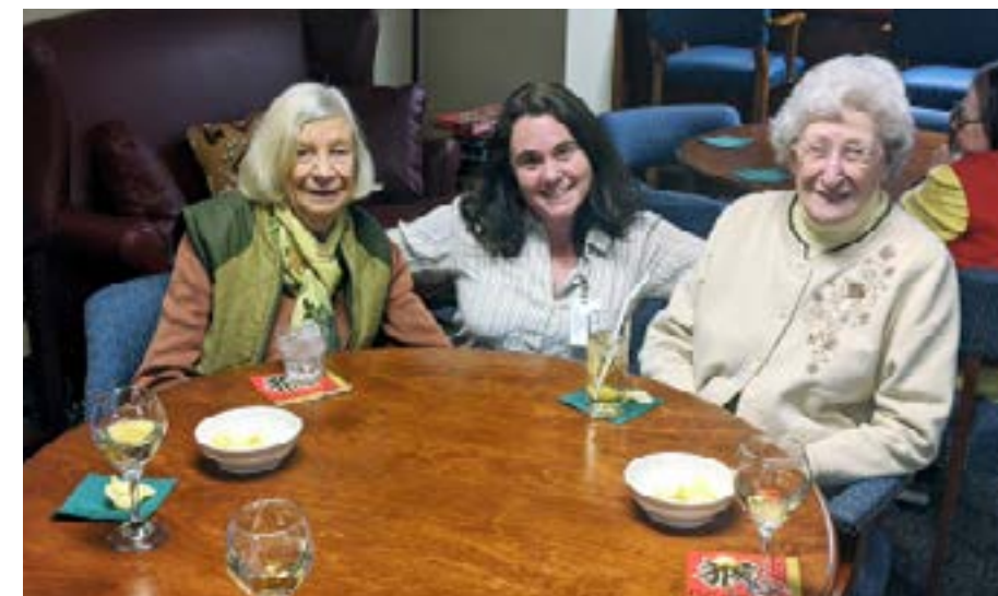
Above: Residents and staff enjoying a Vodka Martini social.