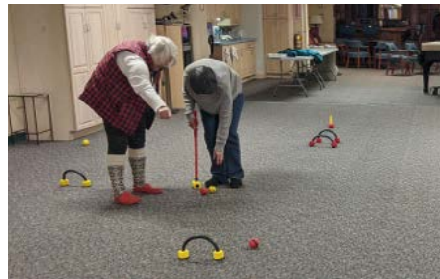
Above: During the winter months, croquet moves indoors for the season.