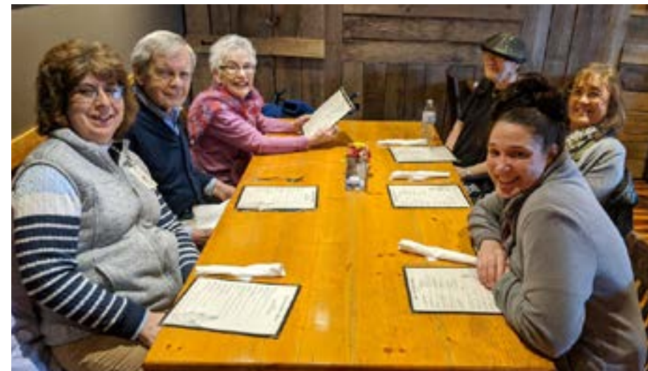
Above: Lunch at Fiddleheads restaurant in Great Barrington, MA.